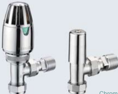
Chrome Angled Pack 15mm x 1/2" 632230 £33.17