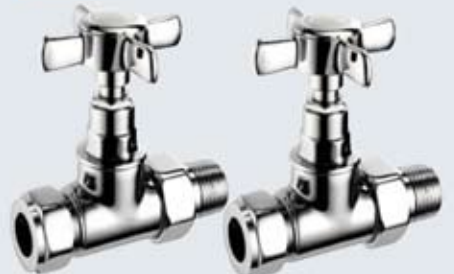
Chrome Straight Pack 15mm x 1/2" 632301 £28.29