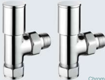
Chrome Angled Pack 15mm x 1/2" 632304 £28.29