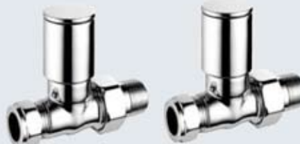
Chrome Straight Pack 15mm x 1/2" 632306 £28.29