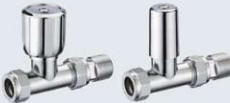
Chrome Straight Pack 15mm x 1/2" 602200 £26.64