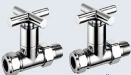
Chrome Straight Pack 15mm x 1/2" 632303 £29.87