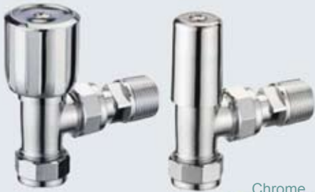
Chrome Angled Pack 15mm x 1/2" 601200 £24.12