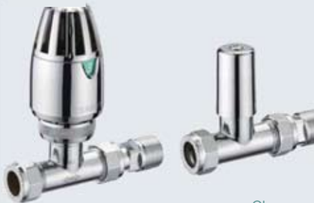
Chrome Straight Pack 15mm x 1/2" 632235 £34.43