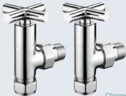
Chrome Angled Pack 15mm x 1/2" 632302 £29.87