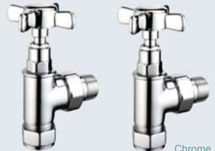
Chrome Angled Pack 15mm x 1/2" 632300 £28.29